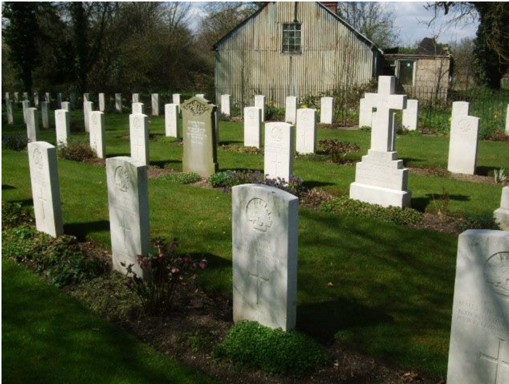
Commonwealth War Graves Headstone for Private C A Jennings is located in Last Row of Australians (Right hand side) Grave Plot # 53 of Codford War Graves Cemetery (CWGC Reference - Grave # 96)