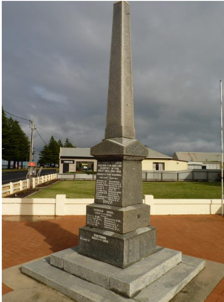
Port MacDonnell War Memorial