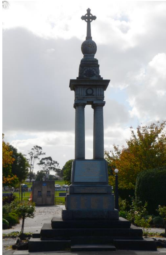
Mt. Gambier War Memorial